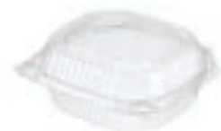
JC-08 165x155x70mm 450/case