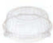
JC-06 190x182x75mm 450/case