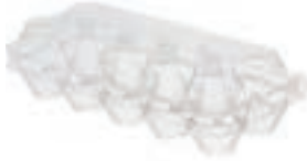
PET-A2-10HL 245x100x70mm 400/case