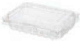
PET-300 181x123x47mm 400/case