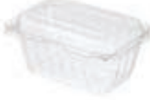
PET-1000-C(NO HOLE) 185x120x90mm 400/case