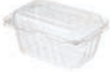
PET-1000(W/HOLE) 185x120x90mm 400/case