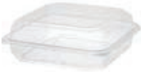
JC-99 9"x 9" 200/case

Recyclable / Crystal Clear / Stackable / Shatter and Crack Resistant