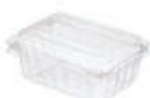
JC-02B 183x119x76mm 400/case