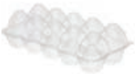
PET-10P-HS 245x110x70mm 1000/case